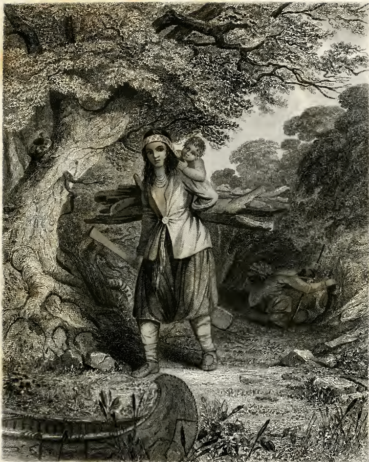
Cap. Eastman's Army B.